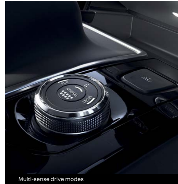
Multi-sense drive modes

The Kiger's rear row comes with sizable knee room of 222mm, a flat floor and elbow width of 1 431mm to help comfortably seat three.