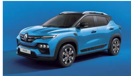
CASPIAN BLUE (MP)