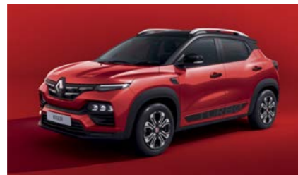
RADIANT RED (Dual-Tone Black roof) (MP)