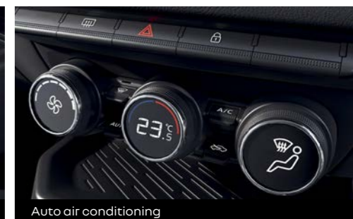
Auto air conditioning