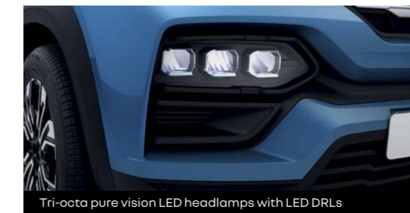
Tri-octa pure vision LED headlamps with LED DRLs

As you drive into the unexpected, stand out with the Kiger's eye-catching dual-tone exterior. The car's sculpted design, tri-octa pure vision LED headlamps with LED DRLs and C-shaped signature LED tail lamps are built for stand-out factor. These are enhanced by the chrome front grille, sporty rear spoiler, shark fin antenna and functional roof bars that have you looking great while you go from one experience to another. The Kiger's 16 inch diamond cut alloys, rear skid plate and high ground clearance of 205mm add to its imposing stance.