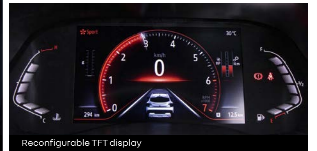
Reconfigurable TFT display