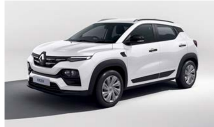
ICE COOL WHITE (NM)