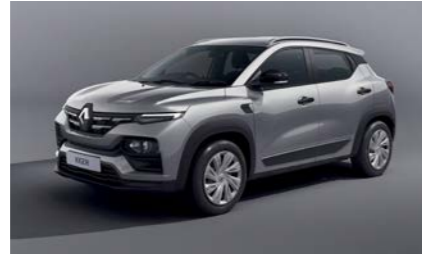
MOONLIGHT SILVER (MP)