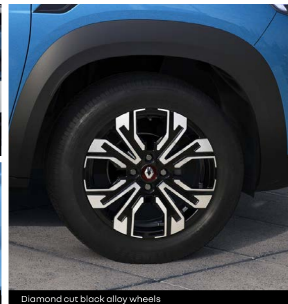
Diamond cut black alloy wheels