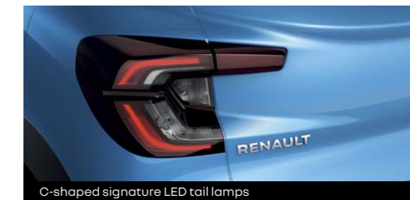
C-shaped signature LED tail lamps