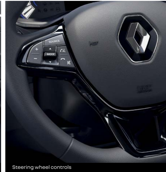
Steering wheel controls