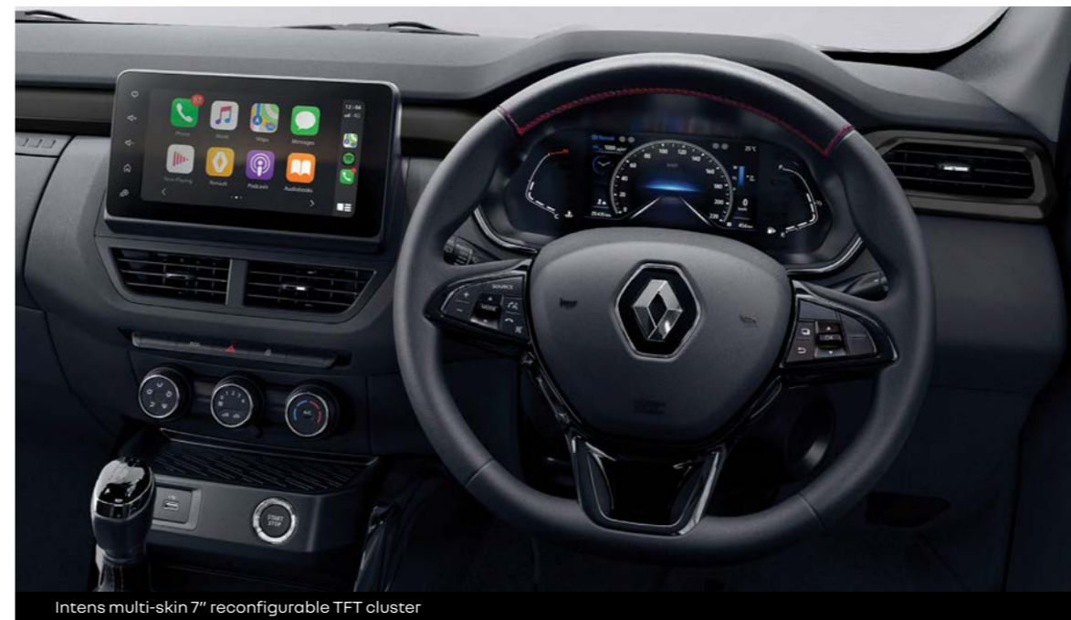
Intens multi-skin 7" reconfigurable TFT cluster

Go where your curiosity takes you with the Renault Kiger. Zip through different experiences with the new 1.0L Turbo petrol engine. The car gives you the best of both performance and fuel efficiency with multi-sense drive modes that work in tandem with the multi-skin 7 inch reconfigurable TFT cluster.