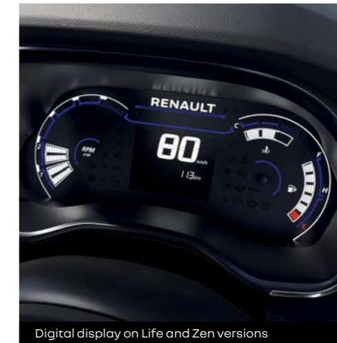
Digital display on Life and Zen versions