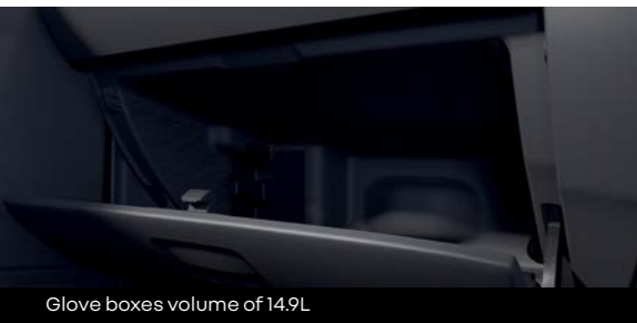
Glove boxes volume of 14.9L