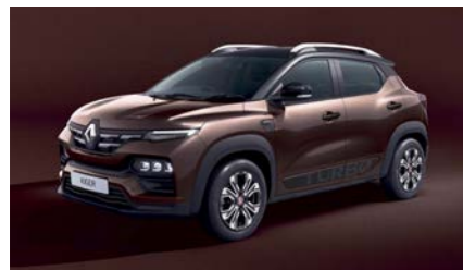
MAHOGANY BROWN (MP)