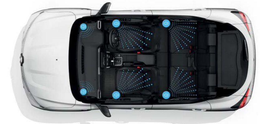
Premium Audio Sound System (4 speakers + 2 tweeters)