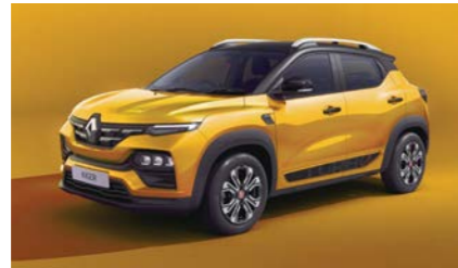
HONEY YELLOW (MP)