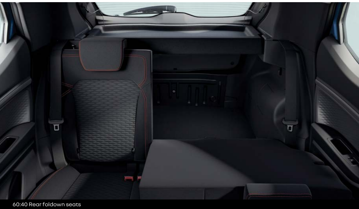
60:40 Rear foldown seats