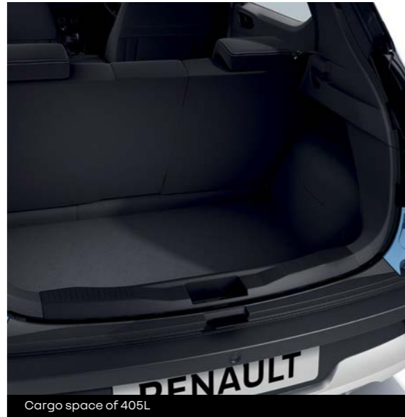
Cargo space of 405L