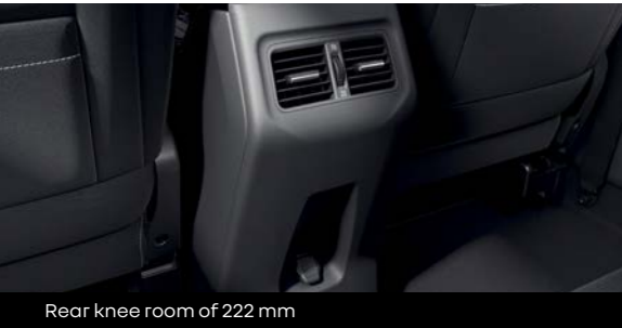
Rear knee room of 222 mm