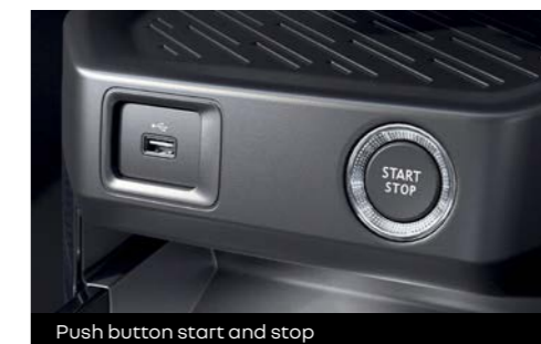
Push button start and stop