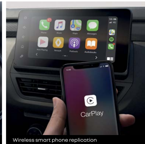
Wireless smart phone replication