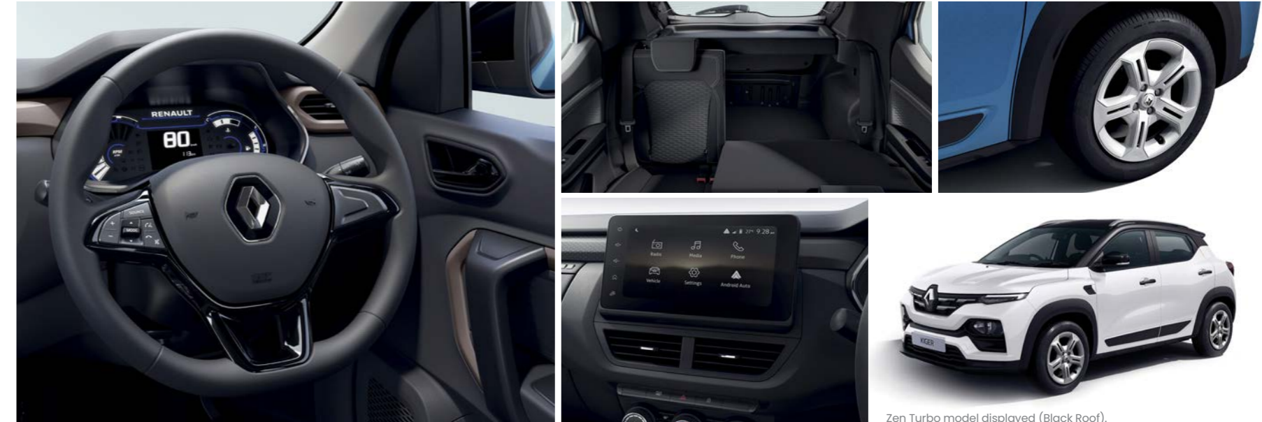
Zen Turbo model displayed (Black Roof).