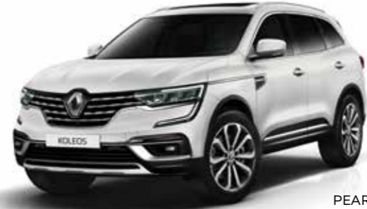
PEARL WHITE (MP)