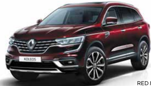
RED MILLESIME (MP)

Note: Printing limitations do not permit subtle paint shades to be shown with complete accuracy.