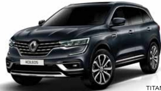
TITANIUM GREY (MP)