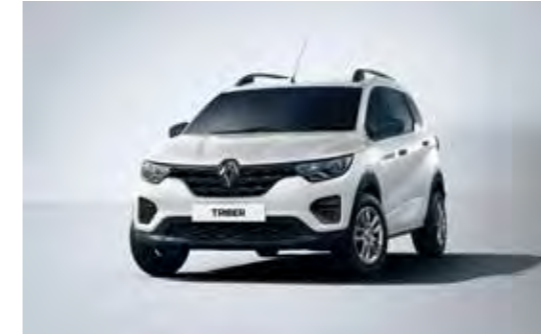
ICE COOL WHITE (NM)