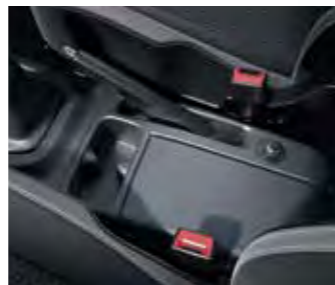
Centre console storage