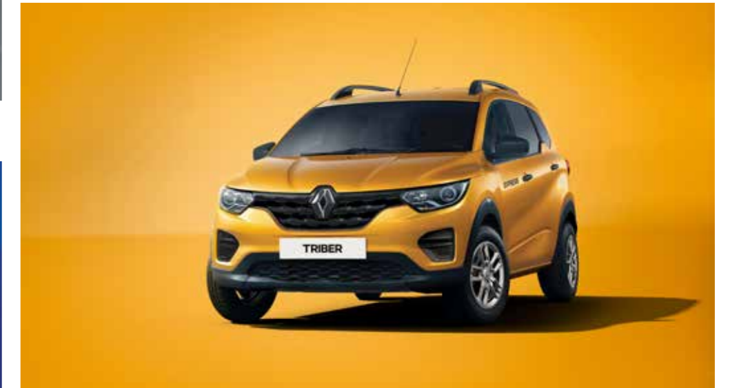
HONEY YELLOW (MP)

NM: Clearcoat Opaque; MP: Metallic Paint