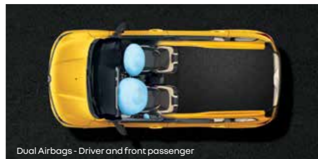
Dual Airbags - Driver and front passenger