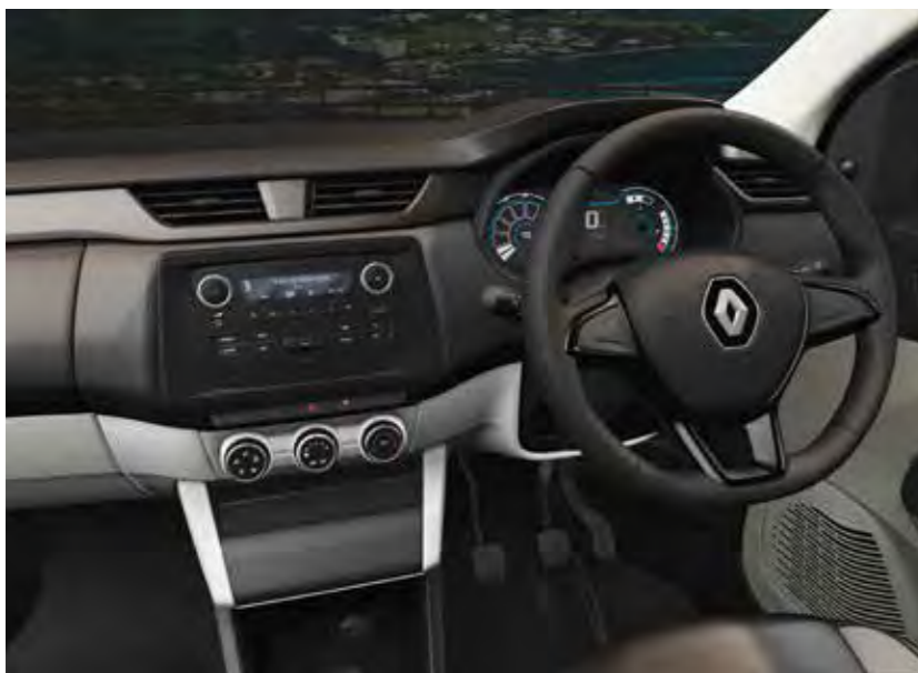
Triber Express interior with R&Go® radio