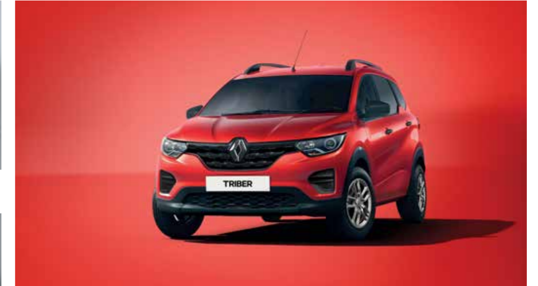
FIERY RED (MP)