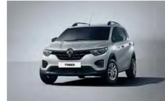
MOONLIGHT SILVER (MP)