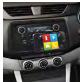
R&Go® radio with additional accessory smartphone mount