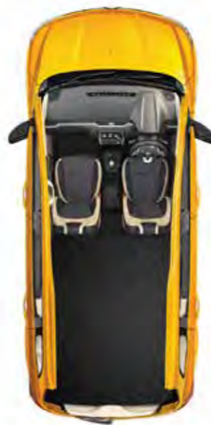
1 500 litre cargo load area 542kg payload