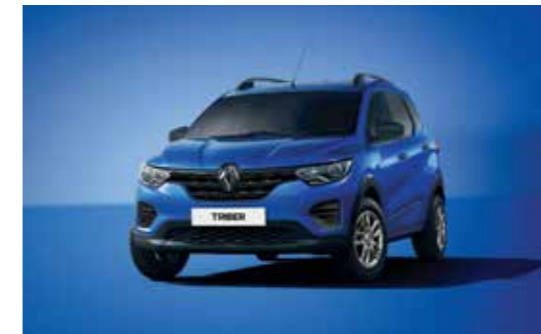
ELECTRIC BLUE (MP)