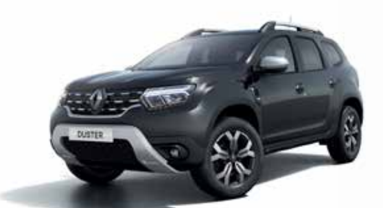
COMET GREY (MP)