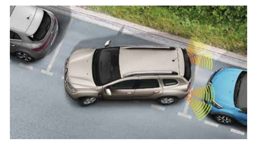
Rear Park Distance Control. To make parking manoeuvres easier. The parking distance control system warns you of obstacles situated behind the vehicle by a sequence of beeps which speed up the closer you are to them.