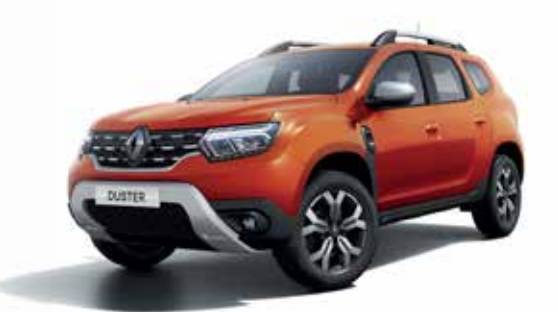
ARIZONA ORANGE (MP)