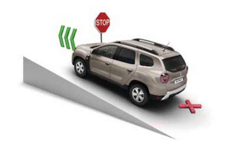
(HSA) Hill Start Assist. Starting the car on steep slopes is no longer a worry. When you take your foot off the brake, hill-starting assist takes over and holds the vehicle steady for two seconds. This gives you time to accelerate normally without stalling or rolling back.