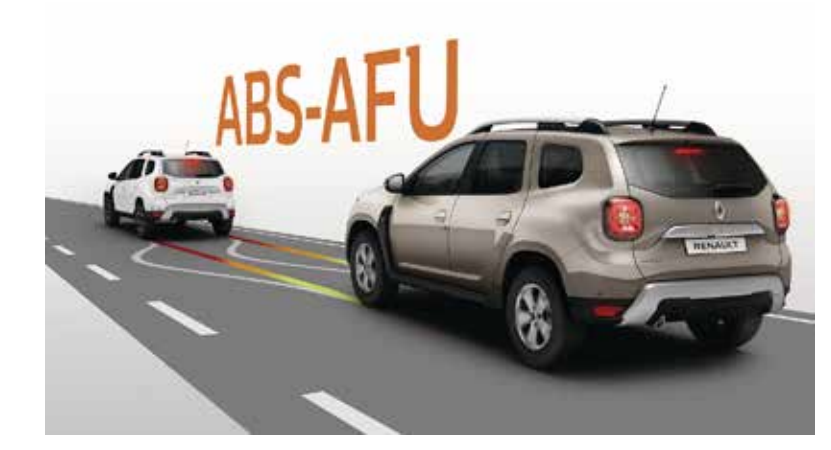
(ABS) Anti-lock Braking System with (EBD) Electronic Brake Force Distribution, in conjunction with (EBA) Emergency Brake Assist: makes it possible to maintain control over the trajectory in the event of heavy braking.