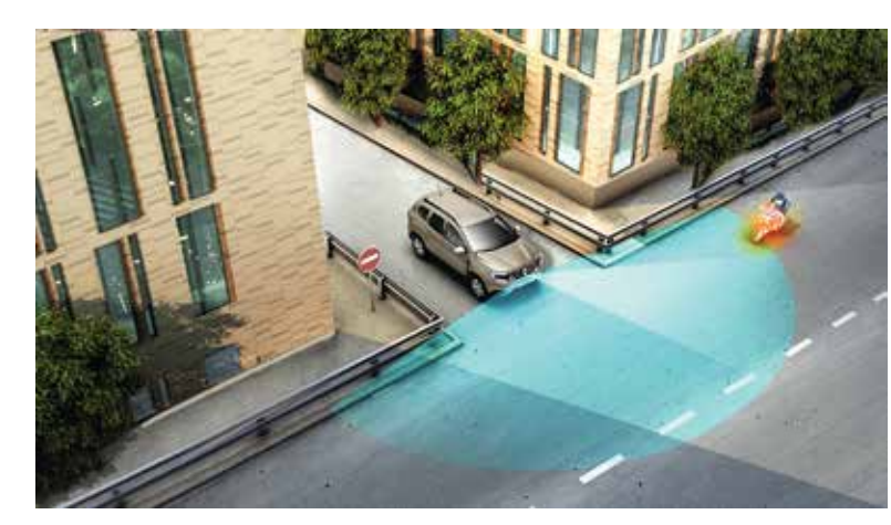
MultiView Camera.* Connected to the MediaNav system, the MultiView Camera shows the images from Duster's four on-board cameras. It is triggered by reverse gear or by a simple touch of the dedicated button. *Standard on 4x4 and Intens model