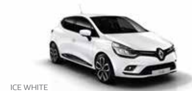
ICE WHITE (NON METALLIC)