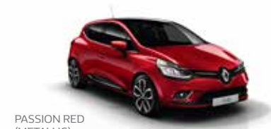
PASSION RED (METALLIC)