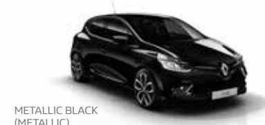
METALLIC BLACK (METALLIC)