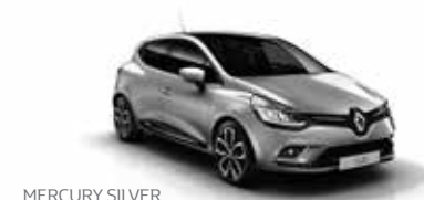
MERCURY SILVER (METALLIC)