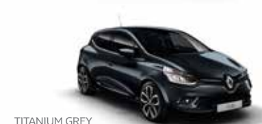
TITANIUM GREY (METALLIC)