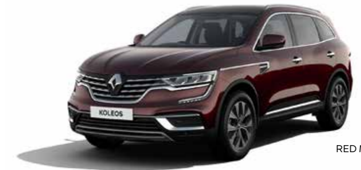
RED MILLESIME (MP)

Note: Printing limitations do not permit subtle paint shades to be shown with complete accuracy.