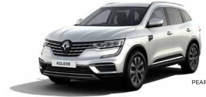
PEARL WHITE (MP)