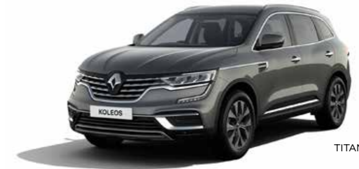
TITANIUM GREY (MP)